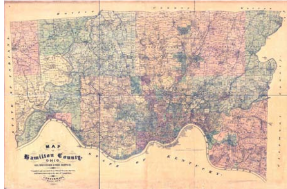
lightened here just for illustration

For full screen, click on double arrow icon at top right corner of the map. Press ESC key to return to web page. To download part of the map once you have enlarged the area of interest you can be on the webpage or Full Screen mode to 'clip image'.